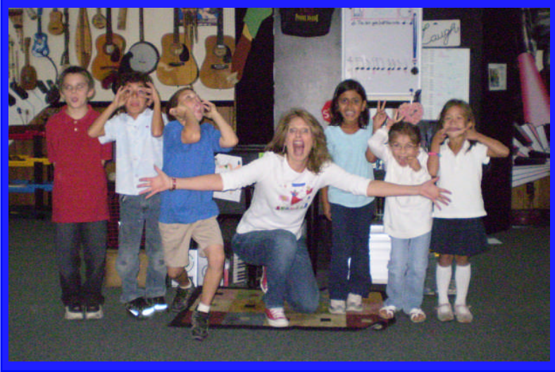
Being silly with some of my students