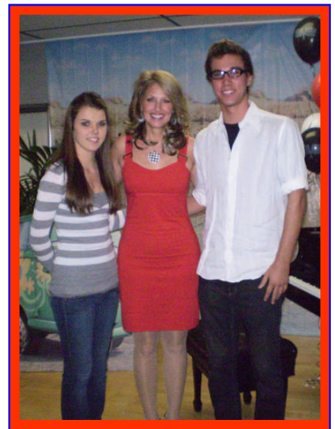
Sharing a special moment with graduates of my classes

Although I thoroughly enjoy being goofy with the children in my classes, I am a serious music teacher. I expect my students to practice every day and do their music homework every week. My students start with “Mary Had a Little Lamb” and when they graduate from my classes - if they practice - they are playing Mozart, Beethoven and Tchaikovsky!